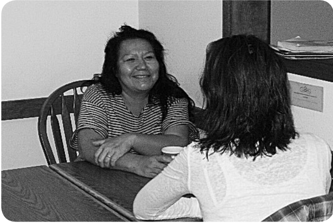
Friends enjoying a cup of coffee at the Women & Children's Home